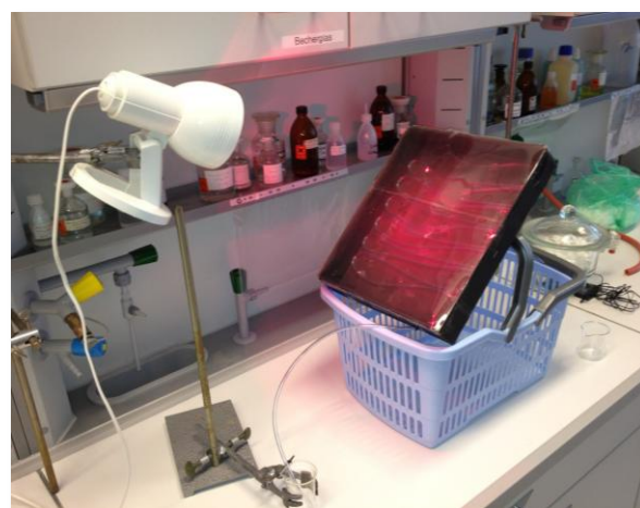
Figure 2. Example of sun collector model

The second major segment of the lesson plan focuses on heat conduction and thermal insulation. It is not the energy production, which is now the focus, but the reduction of heat loss in and around the house. The students compare two detached houses with each other with the